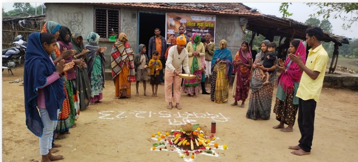
Photo: Community members worshipping soil

The indigenous community have remained the custodian of the nature and has been revering the nature, trees, plants, animals, forests, and rivers as invaluable gifts bestowed upon them by nature. As part of the World Soil Day celebrations, the community meetings were concluded with worship of the Mother Earth, which is a practice in the community. Each farmer brought a handful of soil from his/her field and mixed it with that of others making it a common village soil and worshiped it and seeds with devotion. The community has a common belief that soil or land is their mother as it gives them shelter, food, and clothes. So, after worshipping soil they pledged to protect it, improve its health in order to enhance production. After the prayer and the worship, each farmer took back a handful of soil to spread it in their land as a holy blessing of mother earth. Women, Men, and even children everyone participated in the celebration with joy and festivity. Symbolic tree saplings were also planted in select villages to mark this occasion. More than 1 lakhs farmers in 1041 villages pledged to save, conserve and enhance the nutrition of soil by reiterating various conservation practices and behaviours.