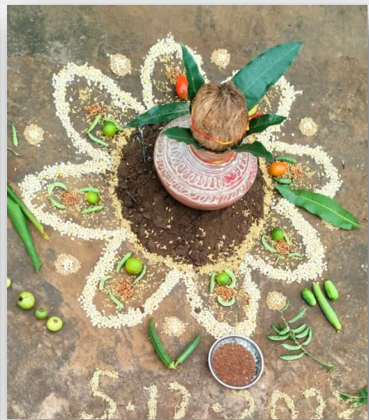
Photos: A Soil and Seeds Rangoli